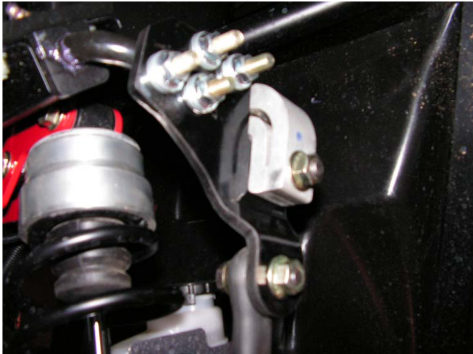
View of swaybar bracket